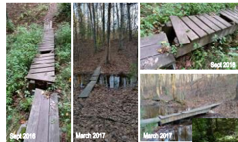
NDEMBA Bay Cross Trail Bridges - Project #2 Photos

Deteriorating Boardwalks in Willowdale State Forest – Ipswich