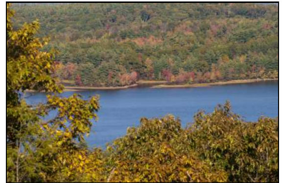
Fitchburg Reservoir as seen from Jewell Hill in Ashburnham.

Through NCLT's efforts and those of its partners, the City of Fitchburg was able to protect land valued at more than $1.5 million at a cost to the City of approximately $100,000.